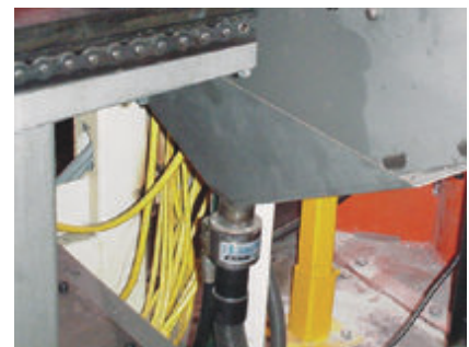
Metal parts are conveyed with the Model 150200 2" (51mm) Heavy Duty Line Vac as they drop off the edge of the conveyor.