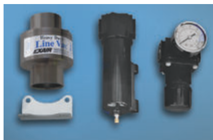
Heavy Duty Line Vac Kits include a Heavy Duty Line Vac, mounting bracket, filter separator and pressure regulator (with coupler).

If you have special requirements, please contact an Application Engineer to discuss the application.