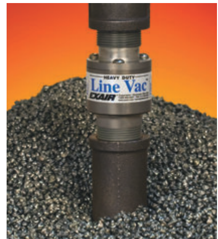
The hardened alloy construction of the Heavy Duty Threaded Line Vac resists wear when conveying abrasive steel shot.

Horizontal conveying tested at 80 PSIG (5.5 BAR)