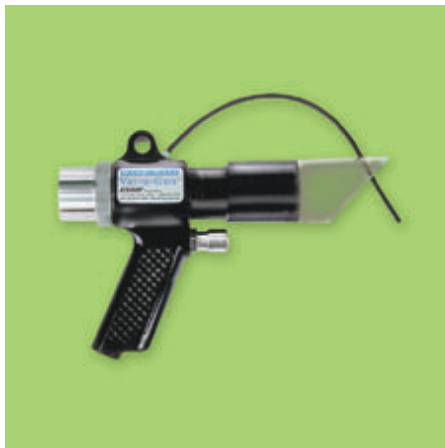
Model 6094 Deep Hole Vac-u-Gun Only