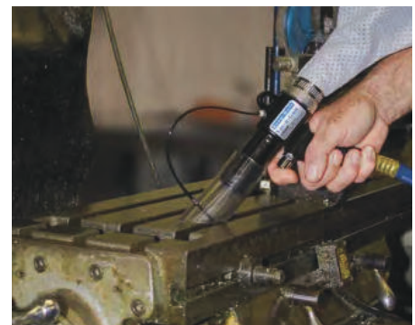
The Model 6194 Deep Hole Vac-u-Gun cleans the t-slots on a milling machine.