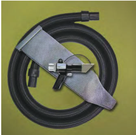
Model 6394 Deep Hole Vac-u-Gun All Purpose System includes Deep Hole Vac-u-Gun, reusable bag and 10' (3m) vacuum hose.