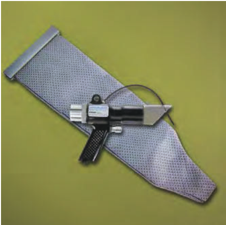
Model 6194 Deep Hole Vac-u-Gun with Bag includes Deep Hole Vac-u-Gun and reusable bag.