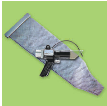
Model 6194 Deep Hole Vac-u-Gun with Bag includes Deep Hole Vac-u-Gun and reusable bag.