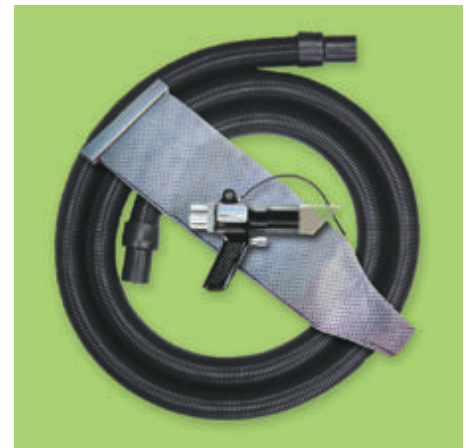
Model 6394 Deep Hole Vac-u-Gun All Purpose System includes Deep Hole Vac-u-Gun, reusable bag and 10' (3m) vacuum hose.