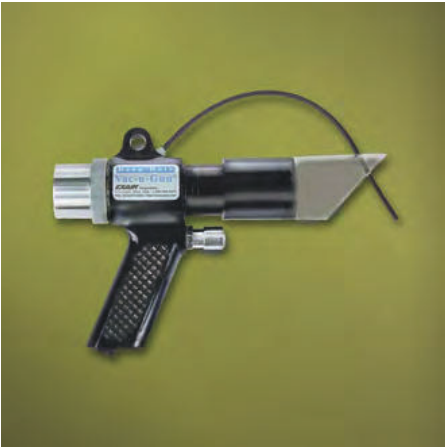
Model 6094 Deep Hole Vac-u-Gun Only