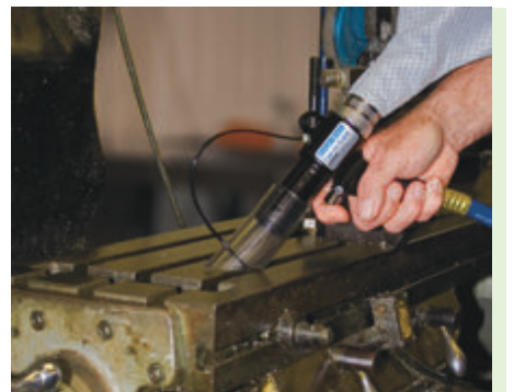
The Model 6194 Deep Hole Vac-u-Gun cleans the t-slots on a milling machine.