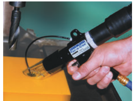
Model 6394 Deep Hole Vac-u-Gun All Purpose System removes the chips from a drilled plastic part.

Lightweight and easy to use, the Deep Hole Vac-u-Gun has a durable die cast construction with no moving parts to wear out. A hanger is provided for easy storage or for mounting on a tool balancer.