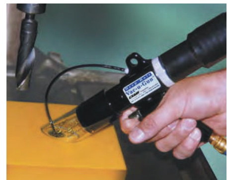
Model 6394 Deep Hole Vac-u-Gun All Purpose System removes the chips from a drilled plastic part.

Lightweight and easy to use, the Deep Hole Vac-u-Gun has a durable die cast construction with no moving parts to wear out. A hanger is provided for easy storage or for mounting on a tool balancer.