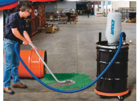
The Heavy Duty Dry Vac cleans up a spill of tumbling media.

Electrically operated vacuums have motors and impellers that clog and wear out quickly. There's also a potential shock hazard when electric vacs are used in standing liquids. The Heavy Duty Dry Vac is compressed air powered which eliminates the shock hazard. It has no moving parts to wear out or break, to assure long life. It is quiet with a sound level that is half that of electric vacs. A static resistant hose prevents painful shocks when vacuuming dry materials.