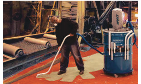
110 Gallon Heavy Duty Dry Vac provides maximum capacity cleanup for a large, dusty walnut shell blasting application.