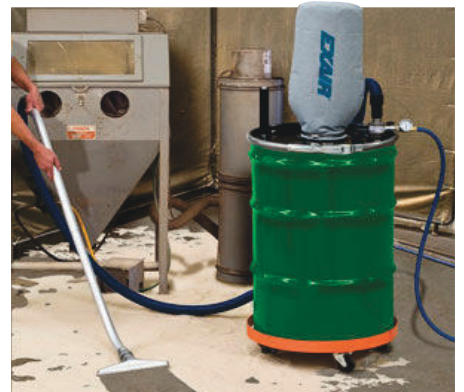
Sand that covers the floor around a sand blaster is quickly vacuumed into the drum using the rugged floor tool.