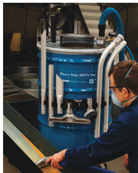
A technician uses a Heavy Duty HEPA Vac to perform scheduled maintenance on a pulverizer.