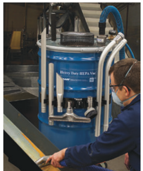
A technician uses a Heavy Duty HEPA Vac to perform scheduled maintenance on a pulverizer.