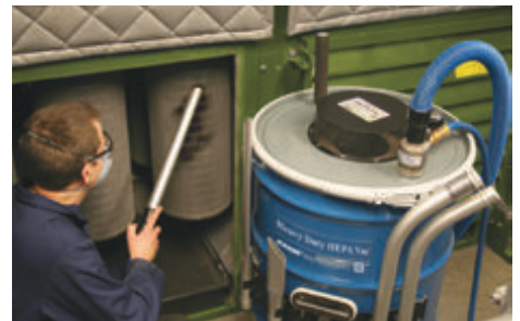
A clogged filtering system for a buffing booth is quickly cleaned and put back into service using the Heavy Duty HEPA Vac.

The Heavy Duty HEPA Vac does not use electricity and has no moving parts, assuring maintenance free operation. This eliminates the risk of electric shock often associated with electric shop vacs. Static resistant hose prevents painful shocks when vacuuming dry, dusty materials.