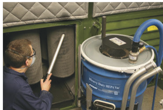
A clogged filtering system for a buffing booth is quickly cleaned and put back into service using the Heavy Duty HEPA Vac.

The Heavy Duty HEPA Vac does not use electricity and has no moving parts, assuring maintenance free operation. This eliminates the risk of electric shock often associated with electric shop vacs. Static resistant hose prevents painful shocks when vacuuming dry, dusty materials.