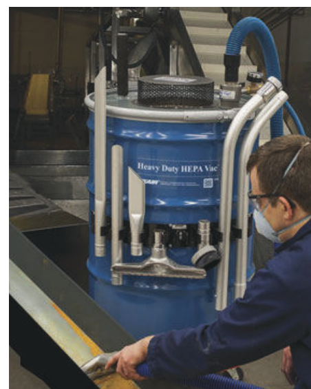
A technician uses a Heavy Duty HEPA Vac to perform scheduled maintenance on a pulverizer.