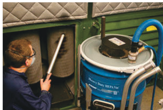
A clogged filtering system for a buffing booth is quickly cleaned and put back into service using the Heavy Duty HEPA Vac.