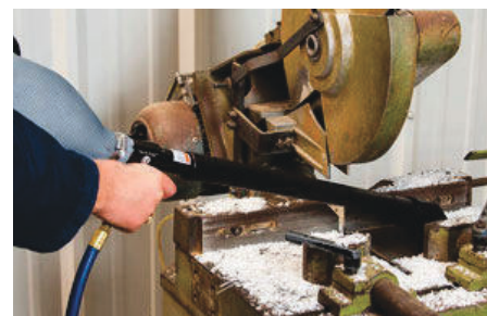
Model 6392 Vac-u-Gun All Purpose System removes plastic shavings from a saw.