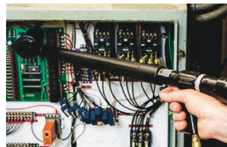
Model 6292 Vac-u-Gun Transfer System carries dust away from sensitive electronic controls.