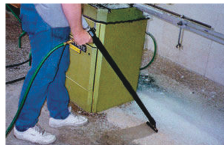
Model 6192 Vac-u-Gun Collection System with bag vacuums absorbent and chips.