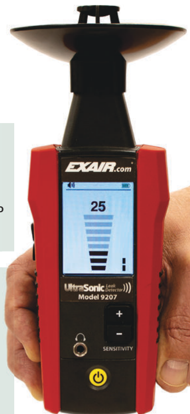
LED indicators on the Ultrasonic Leak Detector show the exact source of the leak or problem.

Ultrasonic sound is a range of sound that is above human hearing capacity. Most people can hear frequencies from 20 Hz to 20 kHz. Sound from 20 kHz to 100 kHz cannot be heard and is called "ultrasonic". The Model 9207 Ultrasonic Leak Detector converts ultrasonic sound emissions to a range that is audible to people. (The sound generated by the ULD is 32 times lower in frequency than the sound that is received.)