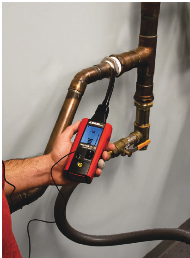
The Model 9207 Ultrasonic Leak Detector with tubular extension quickly pinpoints a costly leak in a noisy industrial environment.

In some cases, the suspected leak is in a hot area and/or close to moving parts. The tubular extension and parabola make it possible to probe these difficult locations from a distance to isolate the leak.