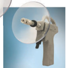
Model 1696SS-CS shown