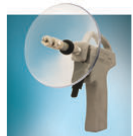
Model 1696SS-CS shown