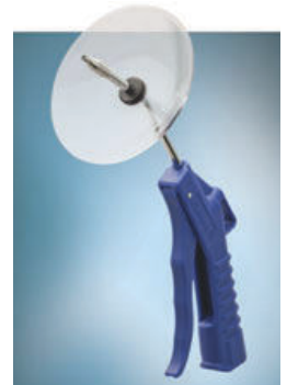
Model 1408SS-CS shown