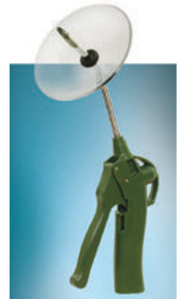
Model 1810SS-CS shown

Model 1310-12-CS is a Model 1310 Heavy Duty Safety Air Gun with a 12" (305mm) Aluminum Extension Pipe and Chip Shield.