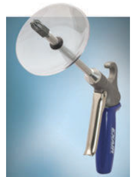
Model 1299-6-CS shown