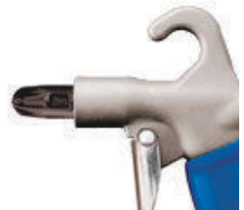
Model 1210-PEEK SG Safety Air Gun Nozzle: 1100T-PEEK Super Air Nozzle

The Model 1210SS uses the stainless steel Super Air Nozzle constructed of Type 316 stainless steel for rugged use and corrosion resistance.