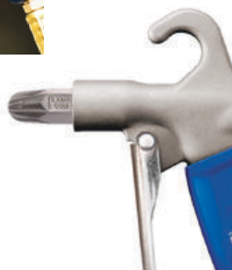
Model 1210SS SG Safety Air Gun Nozzle: 1100SST Super Air Nozzle The Model 1210SS uses the stainless steel Super Air Nozzle constructed of Type 316 stainless steel for rugged use and corrosion resistance.