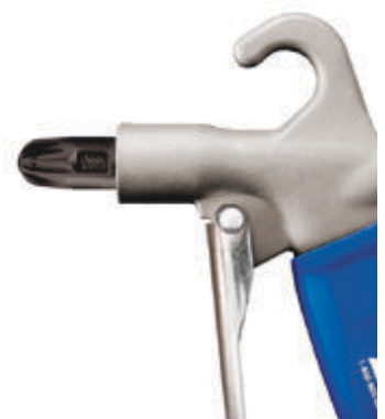
Model 1210-PEEK SG Safety Air Gun Nozzle: 1100T-PEEK Super Air Nozzle The Model 1210-PEEK uses the PEEK Super Air Nozzle for non-marring and chemical resistance.