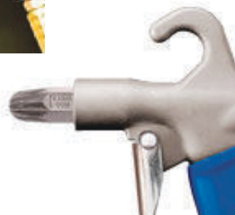
Model 1210SS SG Safety Air Gun Nozzle: 1100SST Super Air Nozzle

The Model 1210SS uses the stainless steel Super Air Nozzle constructed of Type 316 stainless steel for rugged use and corrosion resistance.