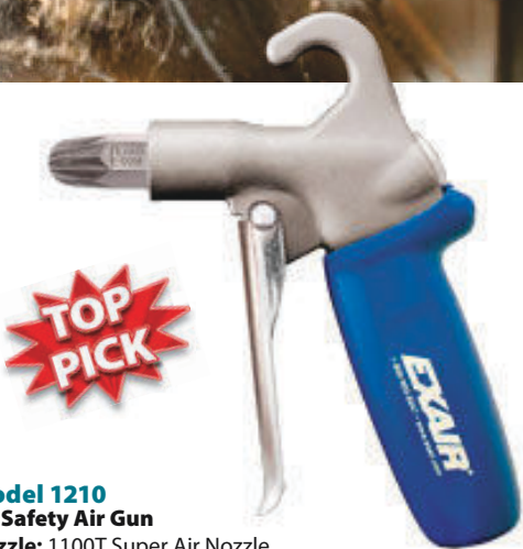
Model 1210 SG Safety Air Gun Nozzle: 1100T Super Air Nozzle