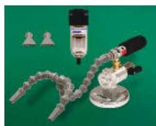
Model 3308 Mini Cooler System (two cold outlets)

Includes Mini Cooler, Single Point Hose Kit, Swivel Magnetic Base and Manual Drain Filter Separator with Mounting Bracket.