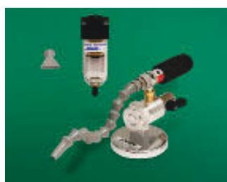
Model 3808 Mini Cooler System (one cold outlet)

Includes Mini Cooler, Single Point Hose Kit, Swivel Magnetic Base and Manual Drain Filter Separator with Mounting Bracket.